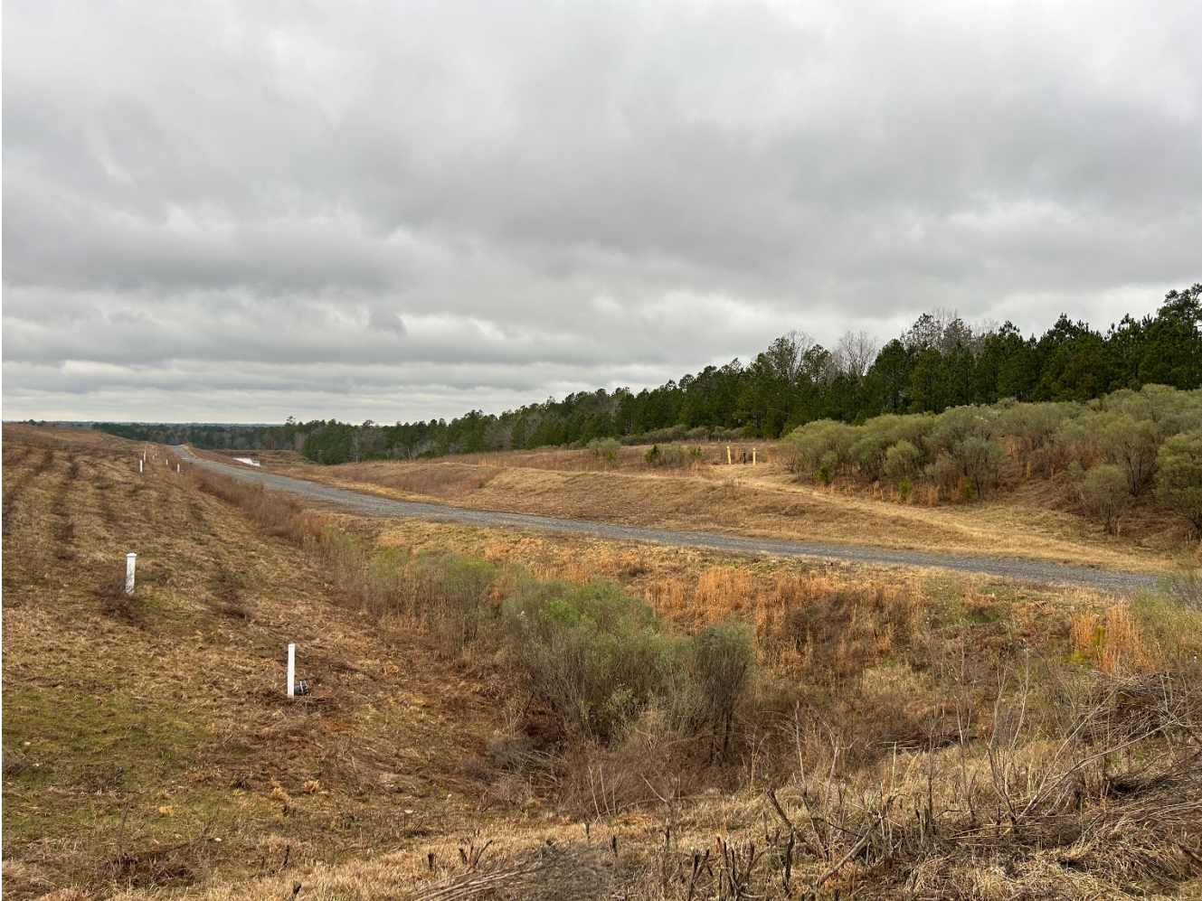
Photo 5 Top deck ramp looking west