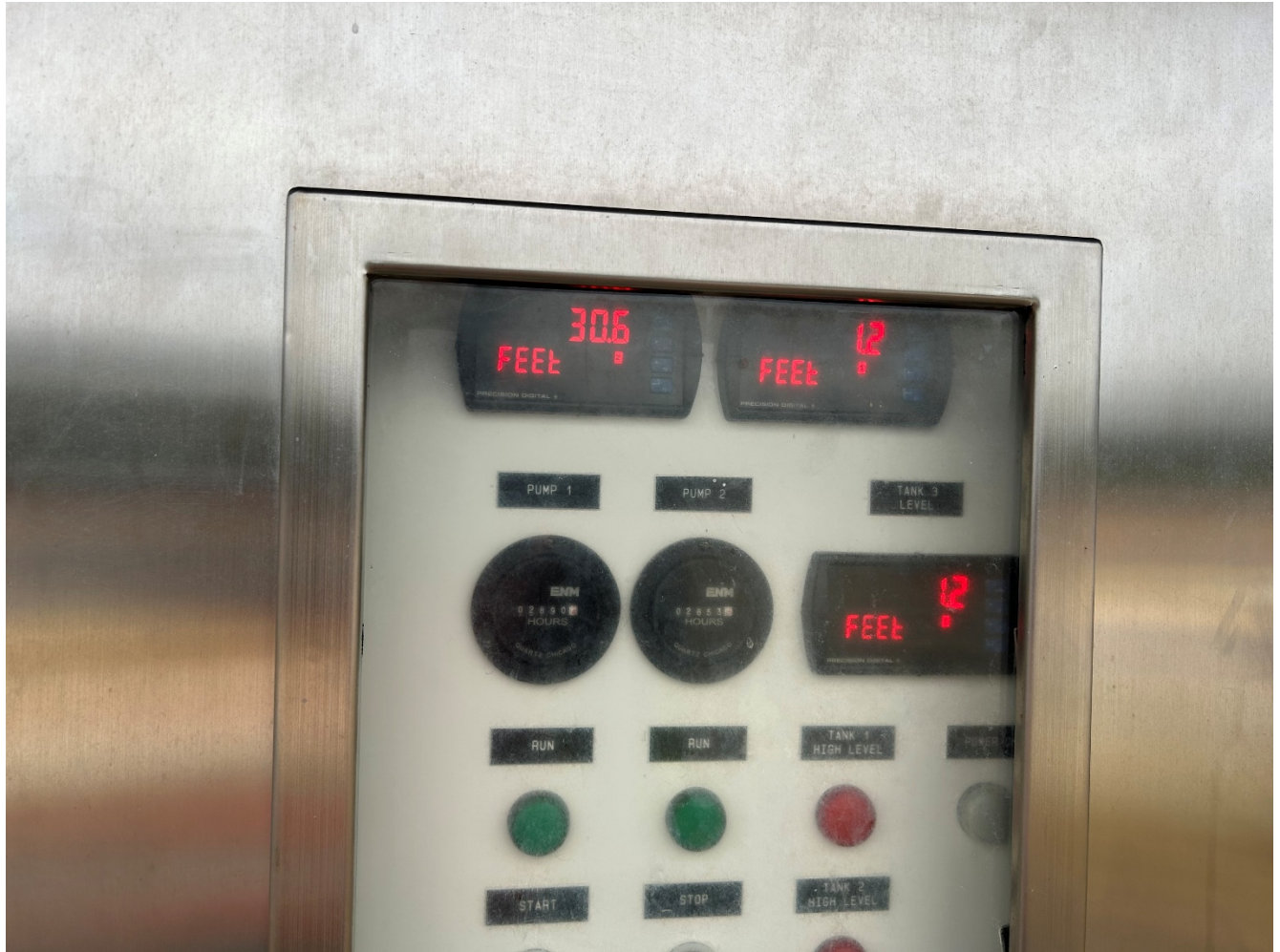
Photo 20 Leachate Tank Levels