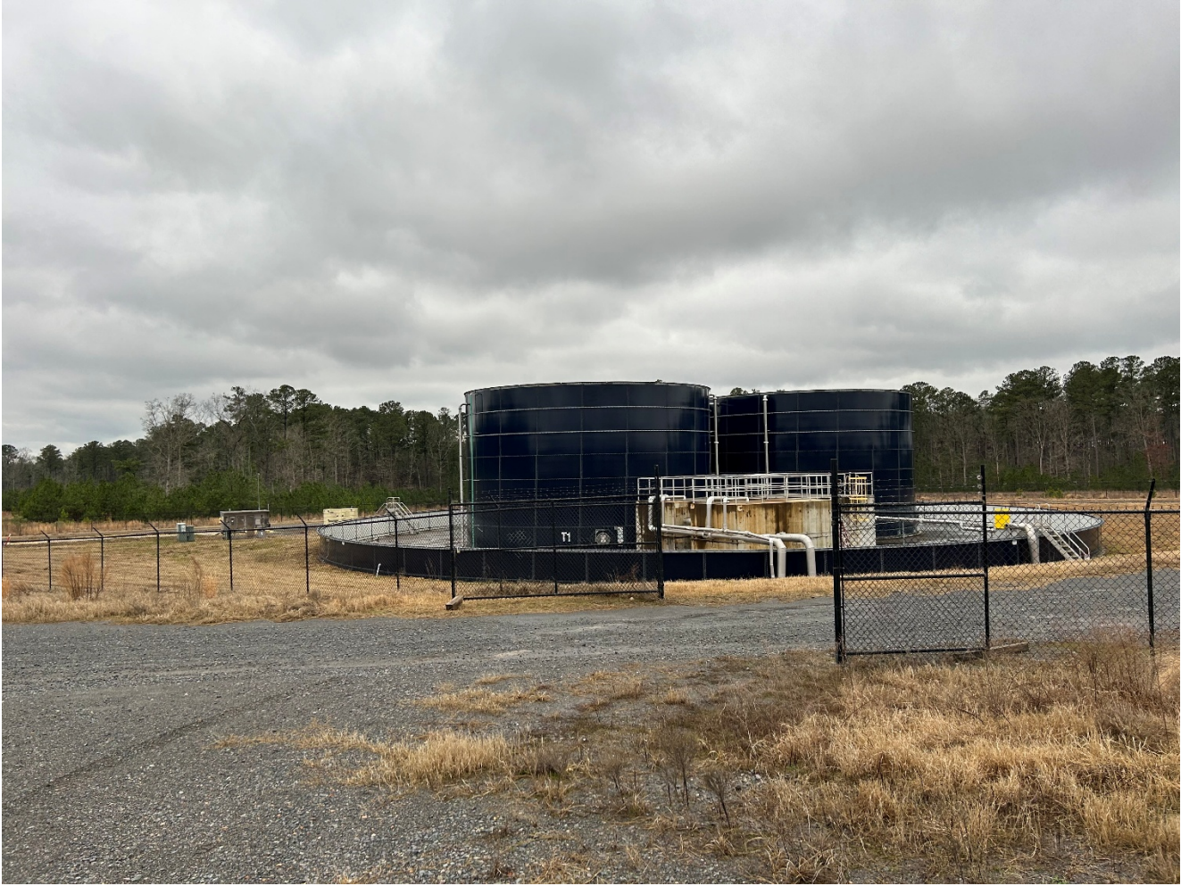
Photo 8 Leachate Tank farm looking south