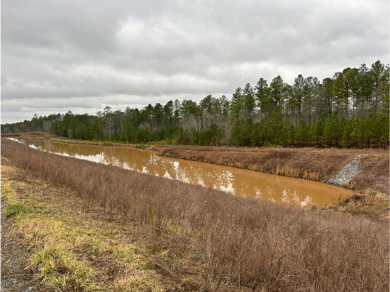
Photo 6 Sediment Basin 1