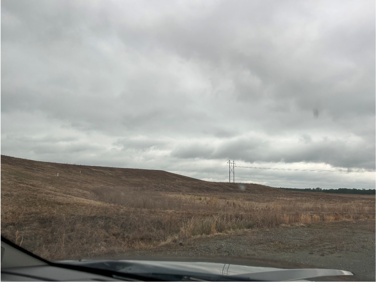
Photo 9 Cell 6 looking east