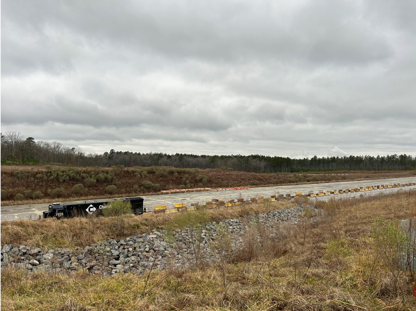
Photo 7 Unloading Area looking west