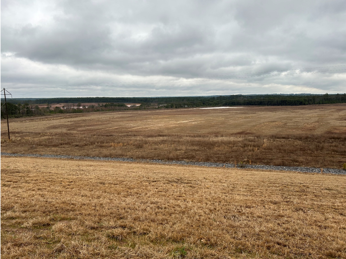
Photo 4 Top of the Closed Unit facing south